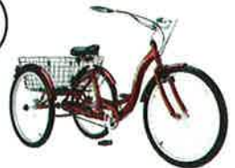
SCHWINN TRICYCLE, $400, CANADIANTIRE.CA.