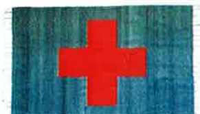
BLANKET, $595, JONATHANADLER.COM.